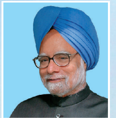
Dr. Manmohan Singh Prime Minister

‘Earlier we used to search for work, Now jobs come to us’